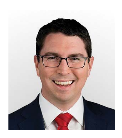
The Hon Patrick Gorman MP Assistant Minister to the Prime Minister March 2023